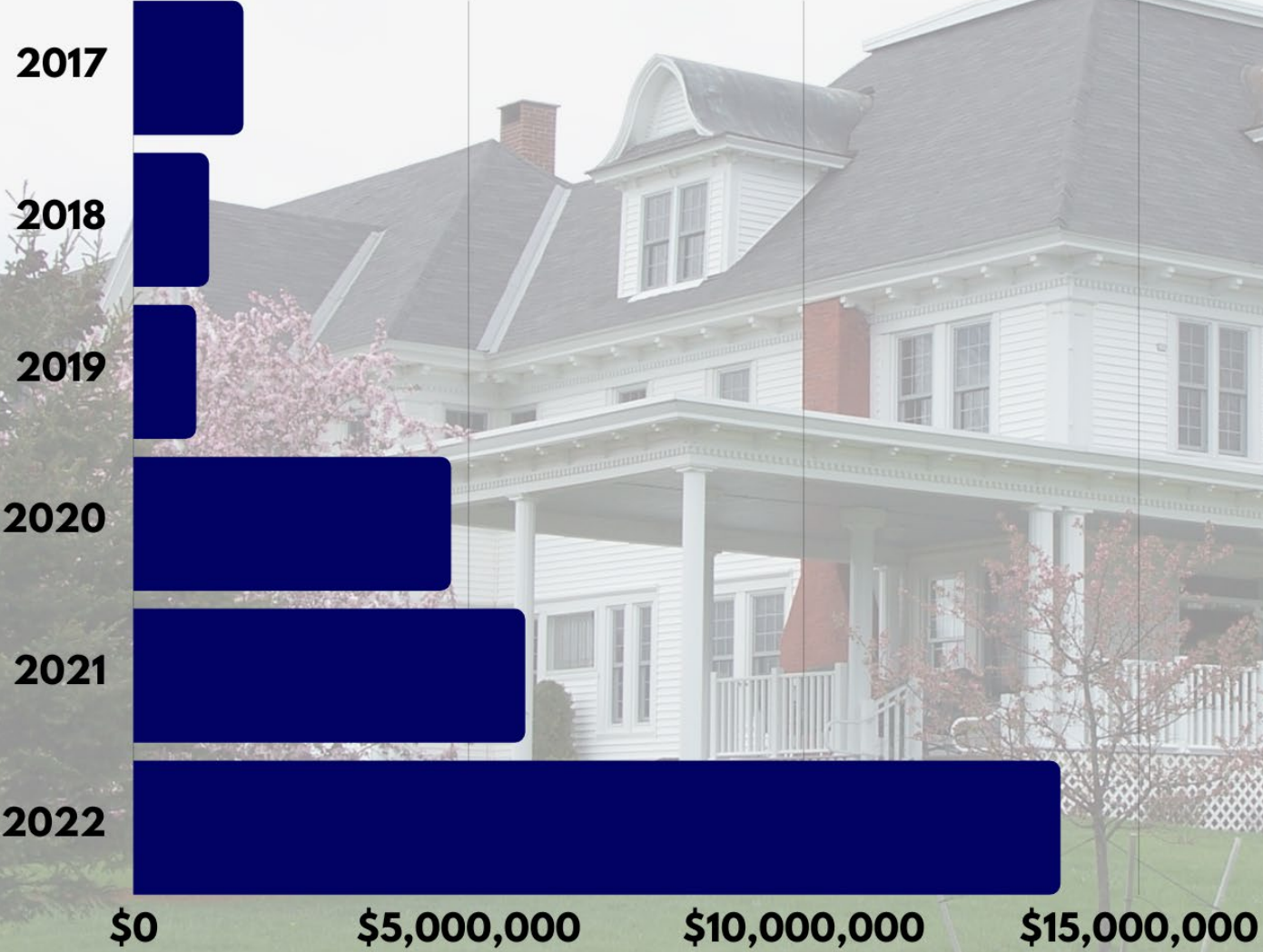
Total funding lent by year